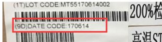
Carton Box Label Markings

Supplier has resolved this process control issue and started shipping new Display/Touch Panel material as of June 14th, 2017. See detailed information below to identify Display/Touch Panel material post corrective action.