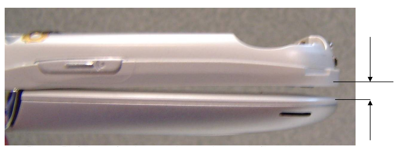
Fig. 1.0 - Flip falls away from base, creating a gap between the flip and base bumpers

Service is aware of an issue, identified during field return analysis of the GSM V600/V600R product, where pressure applied to the flip at hyper-extend can result in the 'Lazy Flip" failure mode. See image below. The root cause is that the hinge cam, in the flip closed position, is not able to provide sufficient force to keep flip closed tight to the base. This allows the flip to open if phone is turned upside down. Severe cases, when used in an active use-case, may lead to customer returns for display flickering due to over cycling of the flip detect switch.