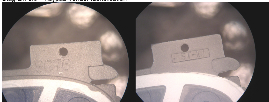
ST = Shin-Etsu

Diagram 3.0 – Keypad Vendor Identification