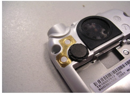
"New" 0188441N02 R-Hsg