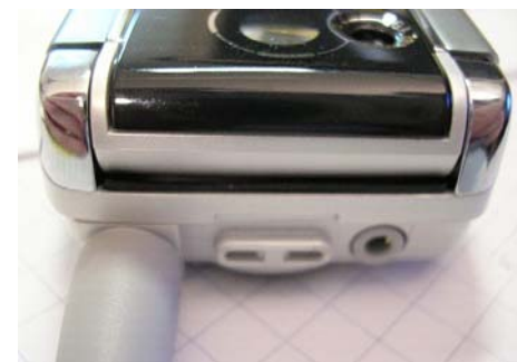
“New” 0188416N02 F-Hsg

The 0188441N01 Base R-Hsg has been modified. The new 0188441N02 part number has additional clearance for the new flip stop design, added RF Coupler for improved RF Stability, and some housing fit features to the screw bosses. See images below.