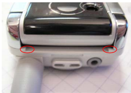
“Old” 0188416N01 F-Hsg

Note: This pre-launch issue has not been highlighted in the field with the various other CLI Lens issues that we do have. The new flip stop does not reduce the CLI Lens issues that have been highlighted in the field. Please reference LVCCFSB2004-63 (Rev. A) for more details on these issues.