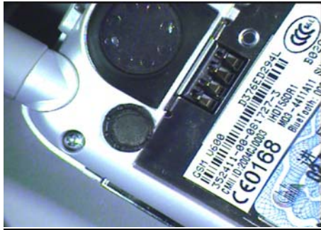
"Old" 0188441N01 R-Hsg