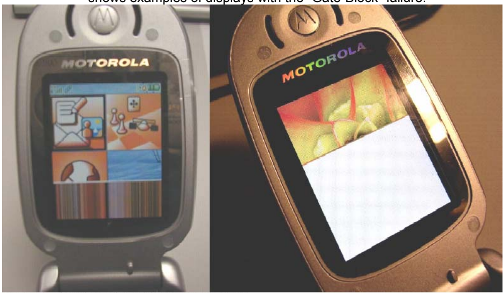
Figure 1.0 - SEC TMR Display with Gate-Block Failure

shows examples of displays with the "Gate-Block" failure.