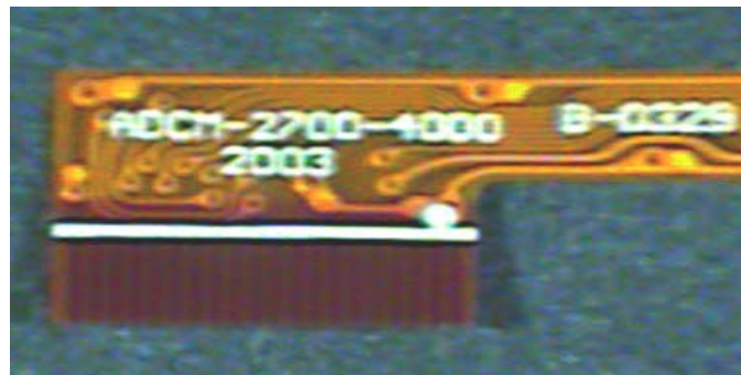
Agilent Camera Markings (ADCM)