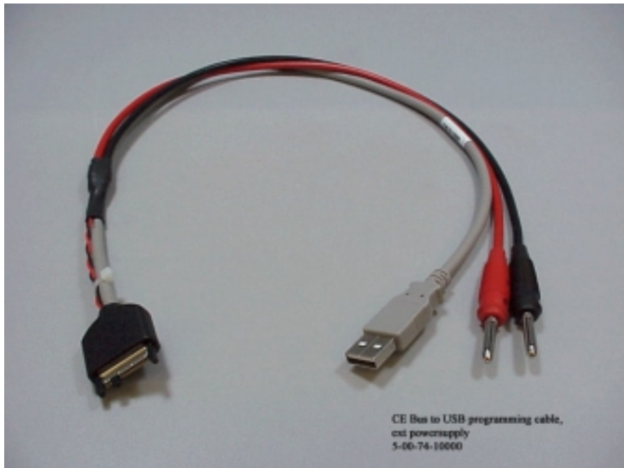
(USB Cable with Ext. Power)

Hardware: WIBU-KEY security dongle (Contact Tech. Support for more info) USB Cable (Motorola: SKN6311A or AMS: 5-00-74-10000) or RS232 Cable (Motorola: SKN6315A and SYN0279B) and USB Force Flash Cable (AMS: 5-00-75-10000)