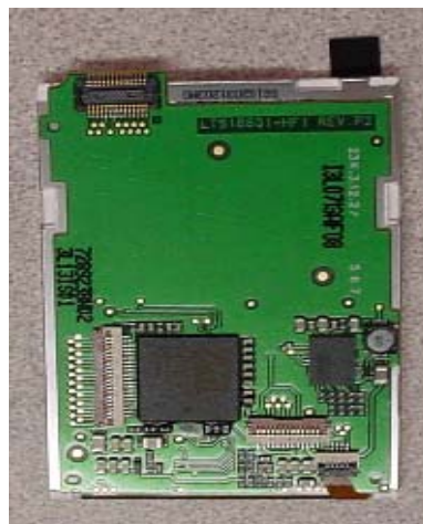
Samsung TMR Display Module