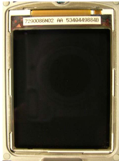
7290086N02 Note the label on display driver Supplier: Sharp