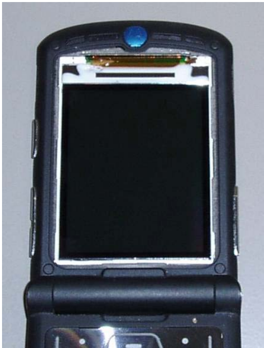
7290086N01 Supplier: Sanyo

7290086N03 - Innolux - 42.10R - Approved for North Asia and High Growth Markets only.