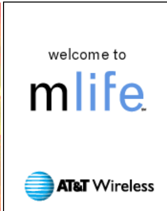
Picture 2 AT&T