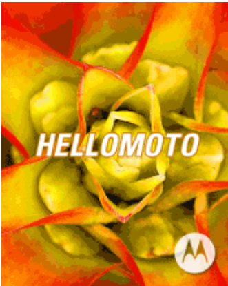
Picture 1 HELLOMOTO

During the NPI analysis, service detected a problem in the MPX200 GSM units with Smartphone 2002 and with IPSM 3.46 & 3.62. Affected phones will not turn on completely, it hang on the HELLOMOTO screen (Picture 1) or on the operator's screen (Pictures 2 & 3), so the battery need to be removed to turn off the phone. The cause of the problem is random memory corruption on the IPSM (Intel Persistent Storage Management) which is the flash file system with the user's data (Contacts, SMS/email, schedules). One possibility scenario for corruption is when IPSM is nearly full which generates a warning message (Picture 4), the user ignores it and continue receiving SMS or emails. Also the IPSM will try to search for more free space, a process called "Reclaim". Reclaim is very a computing-intensive process and if user turns off phone or even pull-out battery the IPSM does not completes the process and the IPSM could crash. The flaw in the operating system and the way it use that might cause random memory corruptions.