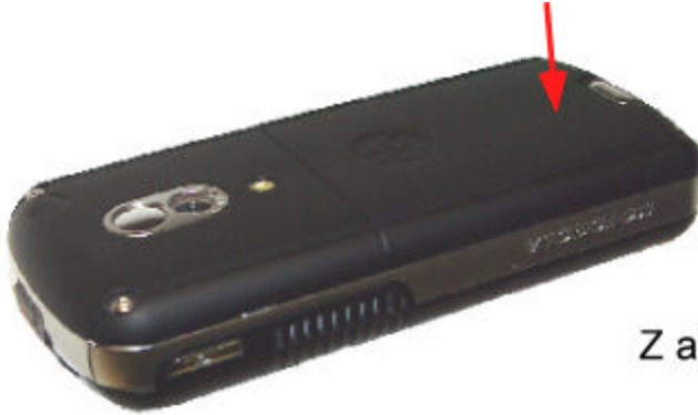
Z axis- battery door up & down movement.

Consumer Solutions & Support US Competency Center 600 North US Highway 45 Libertyville, Illinois 60048 Website: gs.mot.com