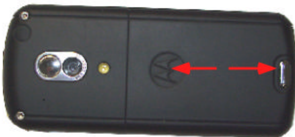
Y axis- battery door side movement.