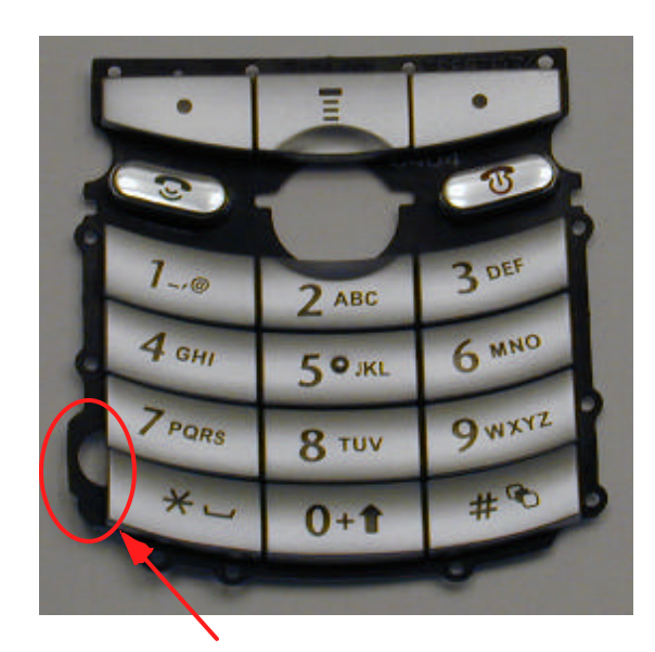
New 3 key keypad