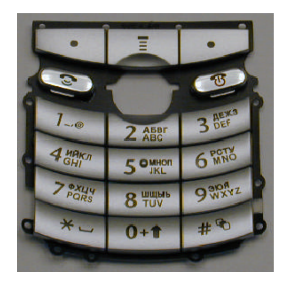
Old 3 key keypad