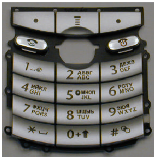
Old 3 key keypad