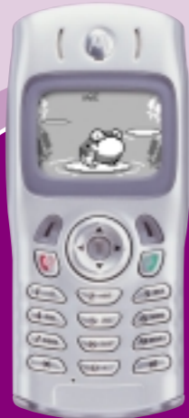
Actual size Colour: Frosted Silver

The Motorola C330 series. Make it totally yours.