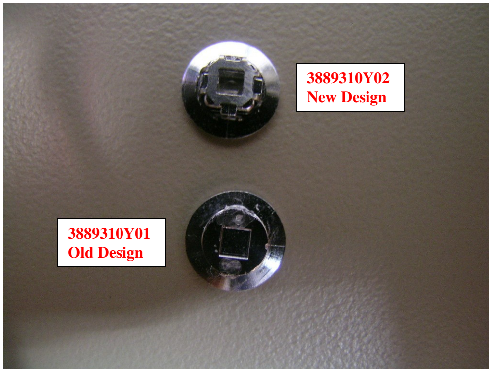
Fig B. Shows new and old retention device

Consumer Solutions & Support US Competency Center 600 North US Highway 45 Libertyville, Illinois 60048 Website: gs.mot.com