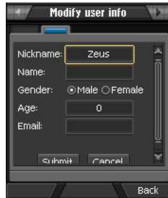
Modify User Info UI