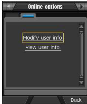
Online Options UI